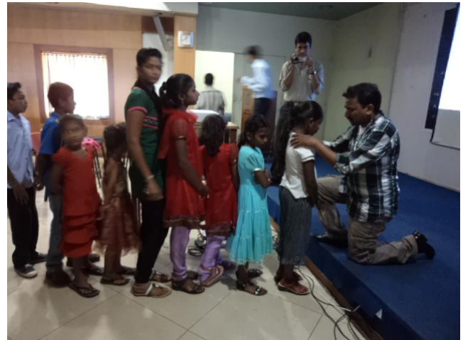
Praying Hands, Open Hearts

The difficult task for me now is to get them to church, because they come from the Hindu and Muslim families, they go back to their home and will follow their parents. It's not very easy to follow on regularly. But I can do this "Sir, If you give us food you can get us." What I have in my heart is this, invite them to the church every alternate SONdays, give them snacks and teach them the Bible. I trust the Lord will make a way for me to keep this going.