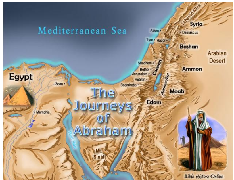
Map of the Journeys of Abraham

The land of Canaan would be the inheritance of Abraham's descendants but Abraham would only be a pilgrim there. On his journey to Canaan there were seventeen places that Abraham visited recorded in the Old Testament. Each of these places is important in the history of Israel and there is evidence of their existence in ancient times through archaeology.