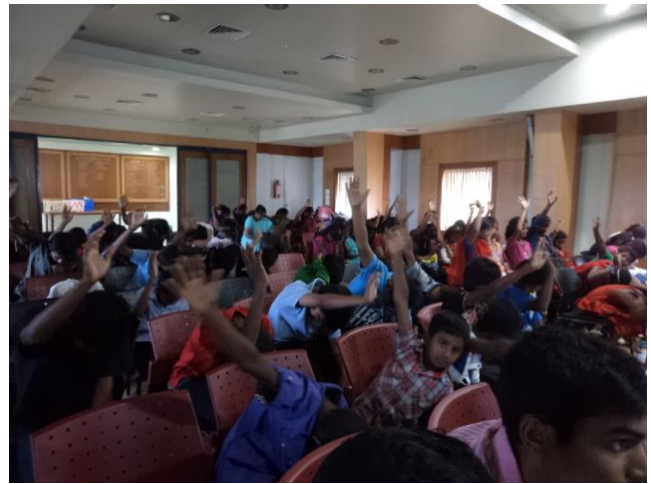
Youths Awakening Raised Hands Following Altar Call

After the meeting they came in line to get prayed, I prayed for them and encouraged them to believe in the Lord Jesus Christ.