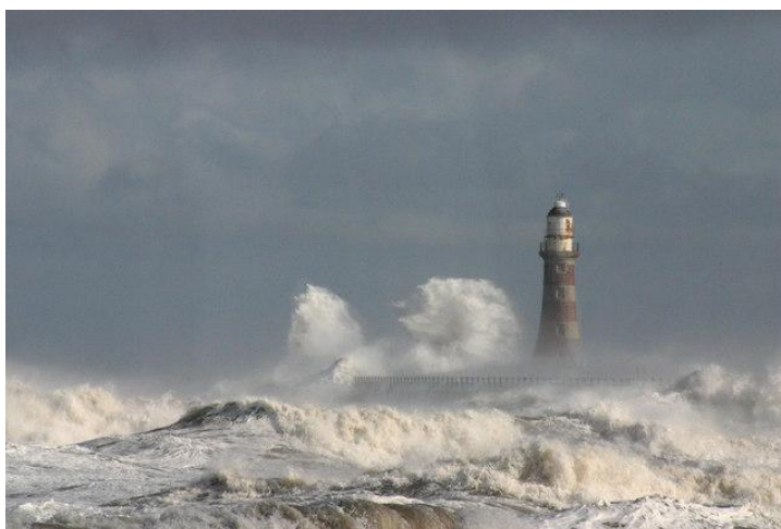
Roker Lighthouse, Sunderland

en.wikipedia.org/wiki/Eternal_Father,_Strong_to_Save . Note that the word brood in the third stanza is wrong and should be move , Genesis 1:2. Apart from that, the hymn is scriptural.