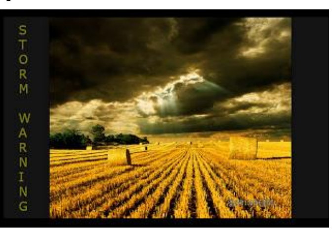
Reaping the Whirlwind the-ten.blogspot.co.uk/2013/07/reapingwhirlwind.html

"For they have sown the wind, and they shall reap the whirlwind..." Hosea 8:7