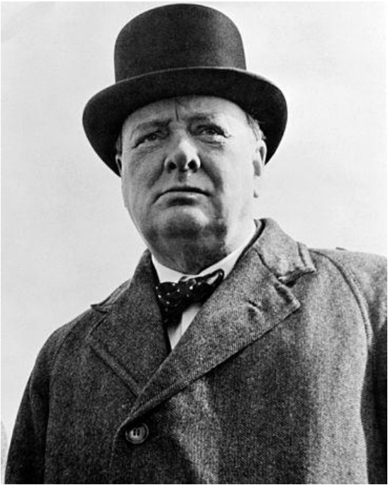
Prime Minister of the United Kingdom en.wikipedia.org/wiki/Winston_Churchill

"Then did I beat them small as the dust before the wind" Psalm 18:42 any and all: