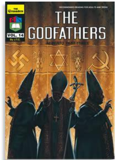
Israel's Worst Enemy

Rome has always opposed Israel and would resist any notion of particular "times of refreshing" for Israel, with no hesitation at Bible corruption 2 Corinthians 2:17 for that purpose.