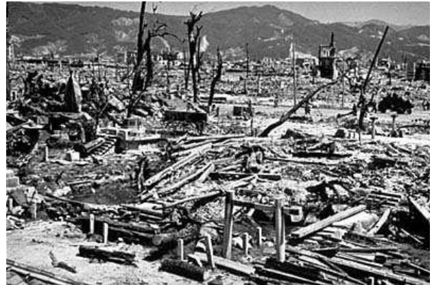
Hiroshima after the Bomb, August 6 th 1945

www.fogonazos.es/2007/02/hiroshima-pictures-they-didnt-want-us_05.html .