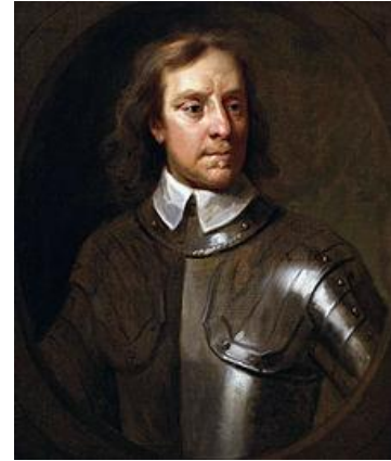
Oliver Cromwell, 1599-1658 Portrait by Samuel Cooper

The wind is also likened to God’s life-giving spirit in Ezekiel 37 and the passage on the valley of dry bones, a passage that Nicodemus would have known about.