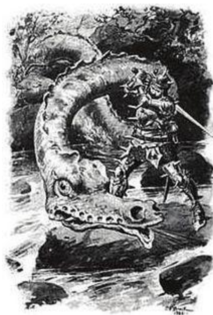
Illustration of John Lambton battling the Worm

See en.wikipedia.org/wiki/Royal_Army_Medical_Corps .