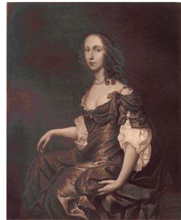
Bridget Cromwell 1624-1662