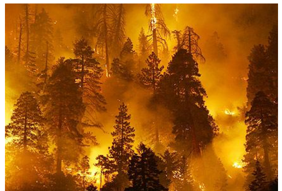
The Fire of Jeremiah

God promises a judgement by fire in the End Times. “And I will send a fire on Magog, and among them that dwell carelessly in the isles: and they shall know that I am the LORD ” Ezekiel 39:6.