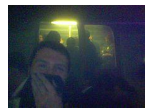
Passengers trapped in a carriage aboard a bombed train en.wikipedia.org/wiki/7_July_ 2005 London bombings