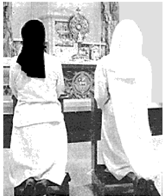
Catholic Twin Circle Perpetual Adoration - Two Benedictine Sisters at the Convent of Perpetual Adoration kneel before the Blessed Sacrament exposed in a monstrance in the convent chapel. Whether at work or at prayer, the nuns focus their lives on Jesus present in the Eucharist.