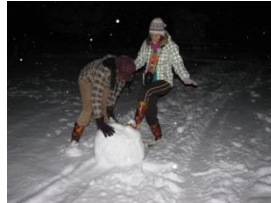
Me & the Mrs!