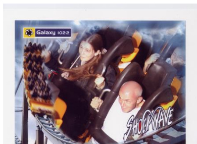
Insanity! The point of no return!