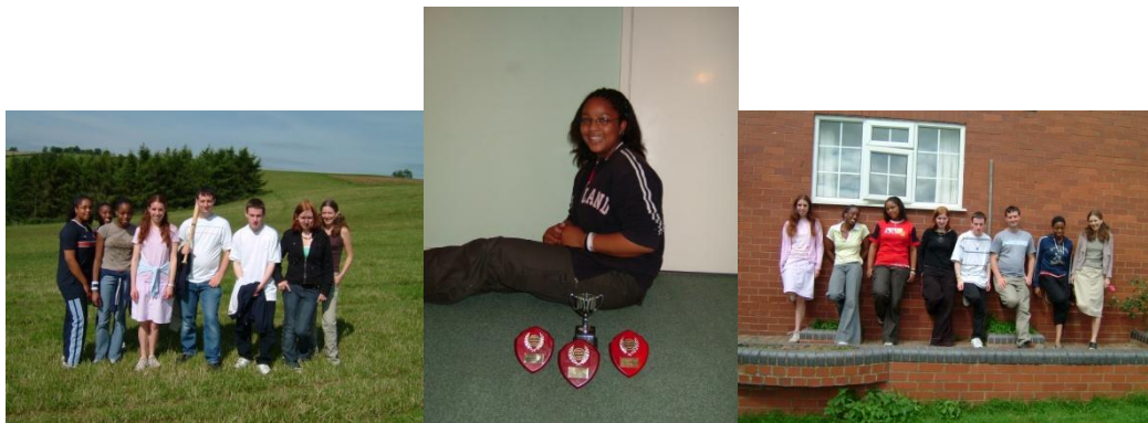
DG Holiday 2005 'Champion'