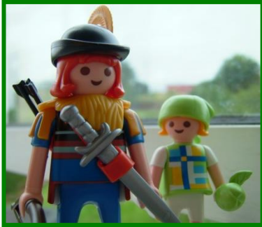
Hope you like our new outfits! Notice the 'AV 1611 SWORD!'

Heb 4 v12 For the word of God is quick, and powerful, and sharper than any twoedged sword , piercing even to the dividing asunder of soul and spirit, and of the joints and marrow, and is a discerner of the thoughts and intents of the heart. Ps 149 v 6 Let the high praises of God be in their mouth, and a twoedged sword in their hand; Rev 1 v16 And he had in his right hand seven stars: and out of his mouth went a sharp twoedged sword : and his countenance was as the sun shineth in his strength.