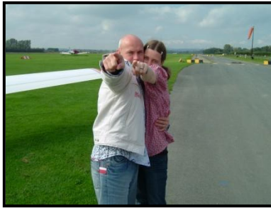
'Don't you point your finger at me!'

There is a generation that curseth their father, and doth not bless their mother. There is a generation that are pure in their own eyes, and yet is not washed from their filthiness. There is a generation, O how lofty are their eyes! and their eyelids are lifted up. There is a generation, whose teeth are as swords, and their jaw teeth as knives, to devour the poor from off the earth, and the needy from among men.