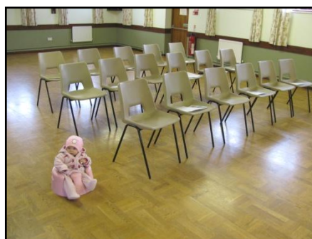
Our youngest member!

We have now delivered over 5000 leaflets around the surrounding areas of Harvington & NOT ONE person has 'come to stay' at the church! We have had quite a few come through the door (Over 30 NON-saved!!!), ALL of which have heard the Gospel, but NONE have ' stayed the course ' so far! It is disappointing obviously, but it also shows the times we are living in. Please keep praying for us as we seek to reach the lost souls of Worcestershire. WE shall continue to distribute Christian literature (tracts, Gospel CD's etc) everywhere we can until the Rapture! (Since writing this article two people have started coming to Oaks Community Church on a regular basis; thank you Lord!)