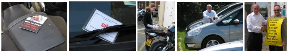
We have just stocked up on another 10,000 'Who Cares?' tracts!

We were also very encouraged to see a man witnessing on the streets with an AV banner & AV tracts (see photo) - he has since written to us. We also passed a number of churches leaving literature with them. Tracting is a great way of getting the Gospel message out, whether you leave them in planes, trains, on cars etc. - that is why I would encourage EVERY reader of 'Tft News!' to distribute tracts. There is a good article on 'Gospel Tracts' in 'The Reformer' magazine (May/June 2009). A few items are as follows... 'Nothing costs less, goes further, lasts longer, or says it better, than a Gospel Tract.' Every phase of the Protestant Reformation in Europe was preceded by an immense tract effort that almost 'turned the world upside down.' Almost every foreign mission field in the world was opened by missionaries who first used tracts to win the heathen to Christ. A son of one of the chiefs of Burd Wain, India, was converted through a single tract, & he was instrumental in winning 1,500 natives to Christ. D.L. Moody began his fruitful evangelistic ministry in Chicago by the simple act of distributing Gospel tracts to Great Lakes seamen!