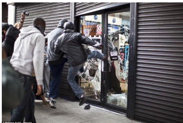
Cain, London 2011

“Being justified freely by his grace through the redemption that is in Christ Jesus: Whom God hath set forth to be a propitiation through faith in his blood, to declare his righteousness for the remission of sins that are past, through the forbearance of God” Romans 3:24-25.