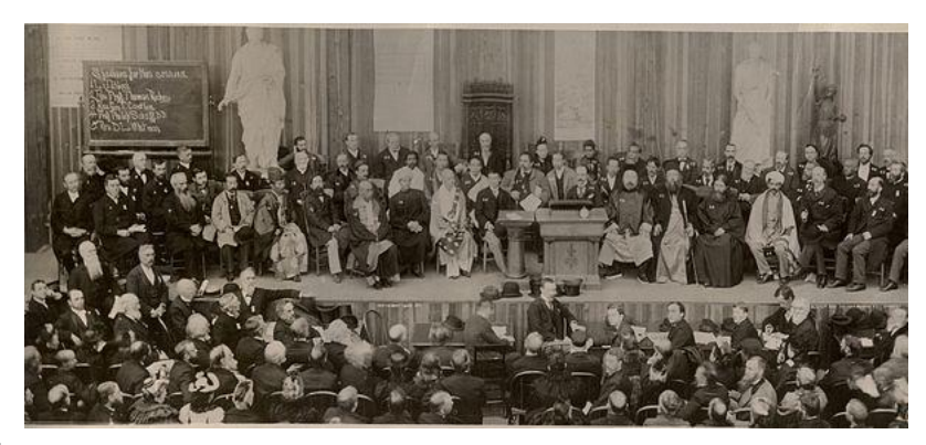
Parliament of the World's Religions Chicago Meeting 1893