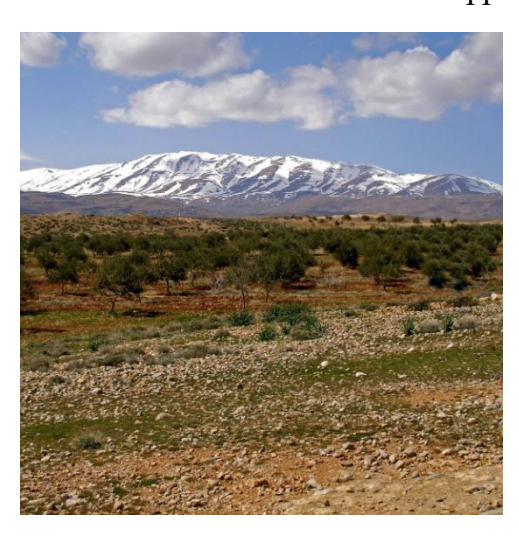
Mount Hermon www.glaphyridae.com/Biogeografia/ SAR.html

Mount Hermon...is located in far north of Israel, north of Dan and east of Tyre, nearly as far north as Damascus. It is one of the highest points in the region. Significantly, it is