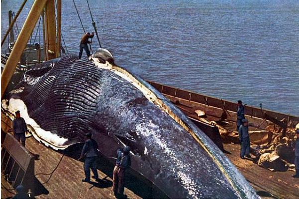
Flensing "leviathan" of "this great and wide sea" Psalm 104:25-26

"Thou brakest the heads of leviathan in pieces, and gavest him to be meat to the people inhabiting the wilderness" Psalm 74:14. Psalm 74:14 is yet future. See remarks above on Job 40:23-24 and note again that the prophet Micah speaks of God's sustenance of Israel in the great tribulation of the End Times "as in the days of old" Micah 7:14.