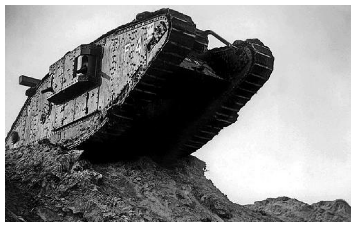
"Someone in the trench said, "THE DEVIL'S COMING!""

"...your <u>adversary the devil</u>, as a roaring lion, walketh about, seeking whom he may devour:" 1 Peter 5:8