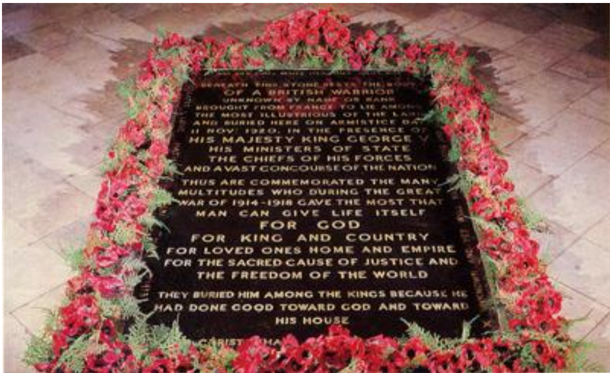
The Tomb of The Unknown Warrior, Interred Westminster Abbey, November 11 th 1920, en.wikipedia.org/wiki/The_Unknown_Warrior

Portions of five Texts of scripture are inscribed on the black marble gravestone. Four are arranged around the edges of the gravestone.