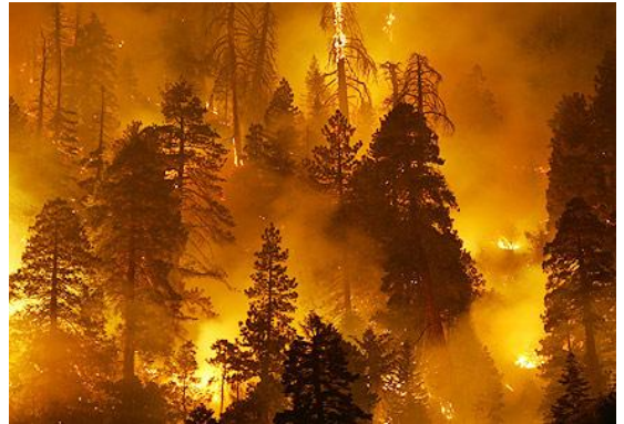
The Fire of Jeremiah

God promises a judgement by fire in the End Times. “And I will send a fire on Magog, and among them that dwell carelessly in the isles: and they shall know that I am the LORD ” Ezekiel 39:6.