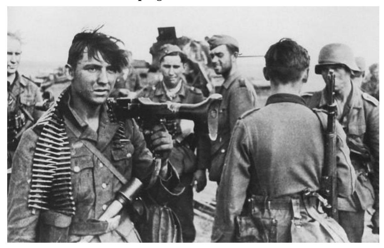
Panzergrenadiers of 16 Wehrmacht Panzer Division, preparing to attack towards the banks of the Volga at Stalingrad November 1942

"My God, my God, why hast thou forsaken me? why art thou so far from helping me..." Psalm 22:1