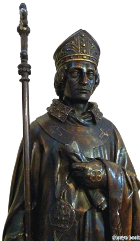
Stephen Langton Archbishop of Canterbury 1207-1228

Chapter-division was apparently the right idea at the right time, and one of the remarkable things about the Langtonian chapter divisions is how they were adopted and propagated by different scholarly communities. Jewish scholars (who had worked with other methods of division previously) soon began observing Langtonian chapter divisions, and the churches of the Christian East took the same divisions over in their biblical studies...