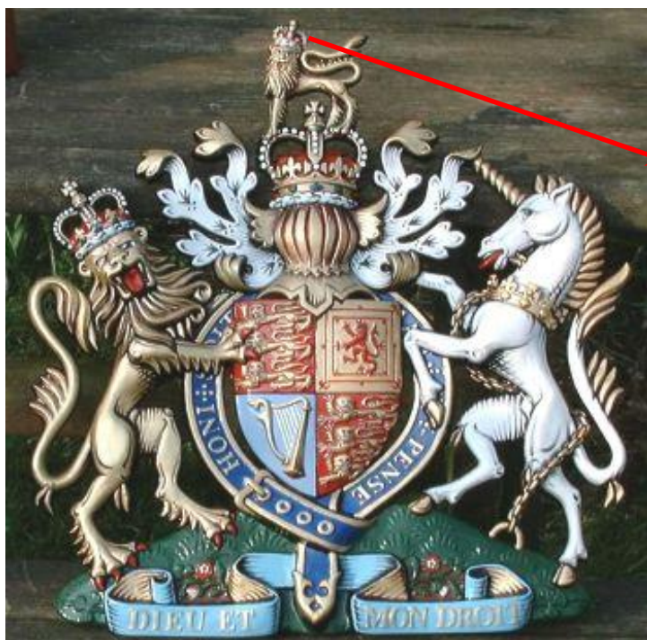
Royal Coat of Arms