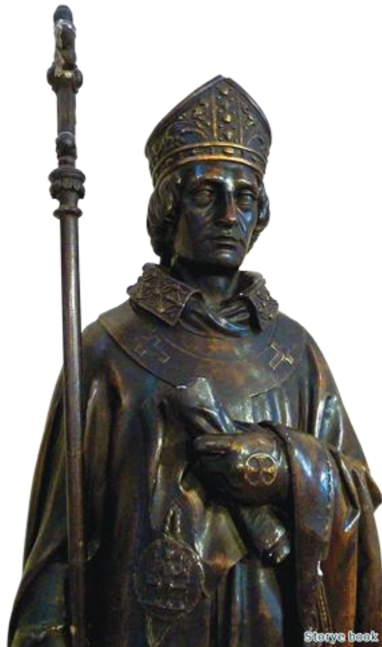
Stephen Langton Archbishop of Canterbury 1207-1228

Chapter-division was apparently the right idea at the right time, and one of the remarkable things about the Langtonian chapter divisions is how they were adopted and propagated by different scholarly communities. Jewish scholars (who had worked with other methods of division previously)