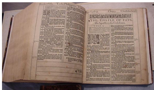
The Authorized 1611 King James Holy Bible www.learnthebible.org/king_james_bible.htm

Philippians 2:16 states “ Holding forth the word of life ; that I may rejoice in the day of Christ, that I have not run in vain, neither laboured in vain. ” Inspiration must be inviolate throughout the purification process of “ the word of life ” otherwise it is no longer “ the word of life ” and Paul and the other writers of scriptures would have run and laboured in vain. However, they did not, because “ the word of the Lord endureth for ever ” 1 Peter 1:25. An overview of God’s seven-stage purification process of “ the word of life ” follows, noting the seven-stage purification sub-processes embedded in the overall purification process.