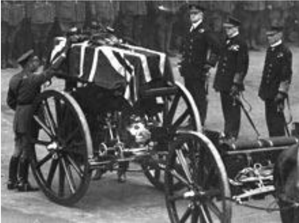
11 th November 1920: King George V placing a wreath on the coffin of the Unknown Warrior 1