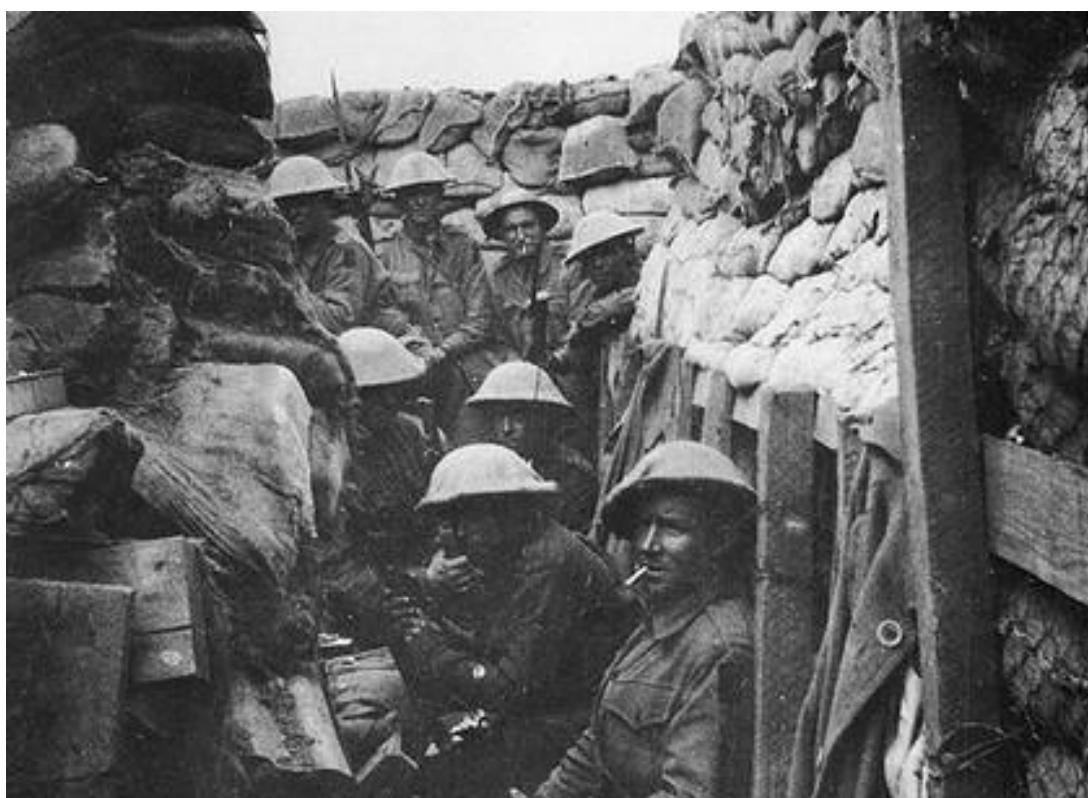
Australians in the trenches at Fromelles July 19 th 1916 4 Only three of the men pictured survived the battle; all three were wounded 5