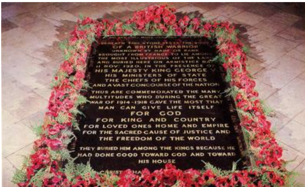
The Tomb of the Unknown Warrior in Westminster Abbey 2

“And they buried him in the city of David among the kings, because he had done good in Israel, both toward God, and toward his house”