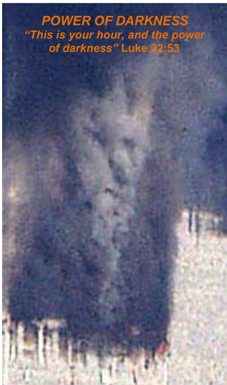
IMAGE OF DARKNESS