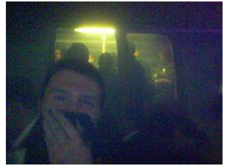
Passengers trapped in a carriage aboard a bombed train en.wikipedia.org/wiki/7_July_2005_London_bombings

We now have another serious practical lesson for the child of God.