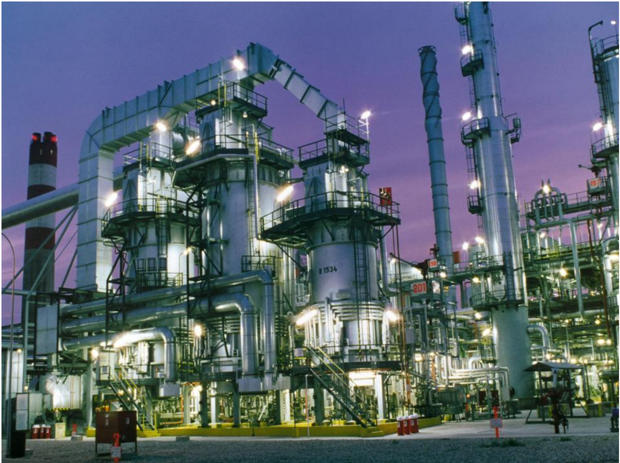
Oil Refinery Plant