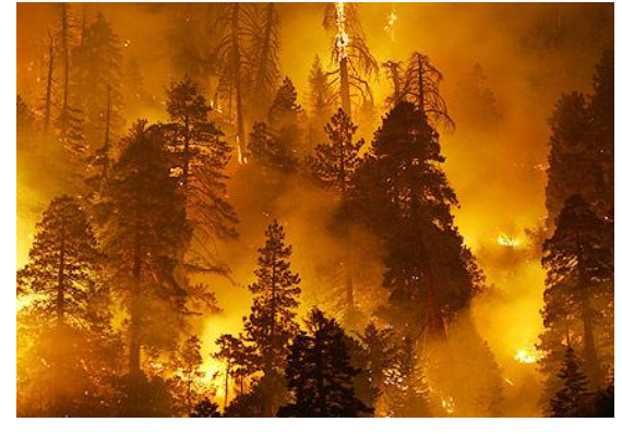
The Fire of Jeremiah

God promises a judgement by fire in the End Times. "And <u>I will send a fire</u> on Magog, <u>and among them that dwell carelessly in the isles:</u> <u>and they shall know that I am the LORD</u>" Ezekiel 39:6.