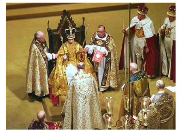
"The Royal Law" James 2:8