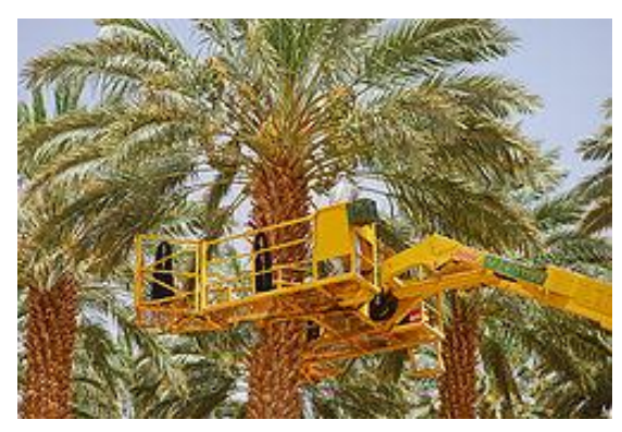
Date harvest in Israel

Agriculture in Israel is a highly developed industry: Israel is a major exporter of fresh produce and a world-leader in <u>agricultural technologies...</u>In 2008 agriculture represented 2.5% of total <u>GDP</u> and 3.6% of exports...While <u>farmworkers</u> made up only 3.7% of the work force, Israel produced 95% of its own food