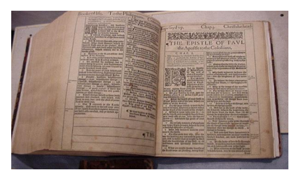
The Authorized 1611 King James Holy Bible www.learnthebible.org/king james bible.htm

Philippians 2:16 states "Holding forth the word of life; that I may rejoice in the day of Christ, that I have not run in vain, neither laboured in vain." Inspiration must be inviolate throughout the purification process of "the word of life" otherwise it is no longer "the word of life" and Paul and the other writers of scriptures would have run and laboured in vain. However, they did not, because "the word of the Lord endureth for ever" 1 Peter 1:25. An overview of God's seven-stage purification process of "the word of life" follows, noting the seven-stage purification sub-processes embedded in the overall purification process.