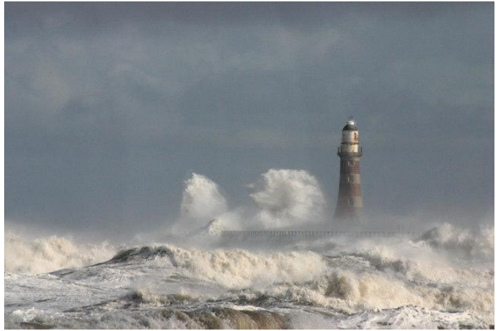
Roker Lighthouse, Sunderland

en.wikipedia.org/wiki/Eternal_Father, Strong to Save . Note that the word brood in the third stanza is wrong and should be move , Genesis 1:2. Apart from that, the hymn is scriptural.