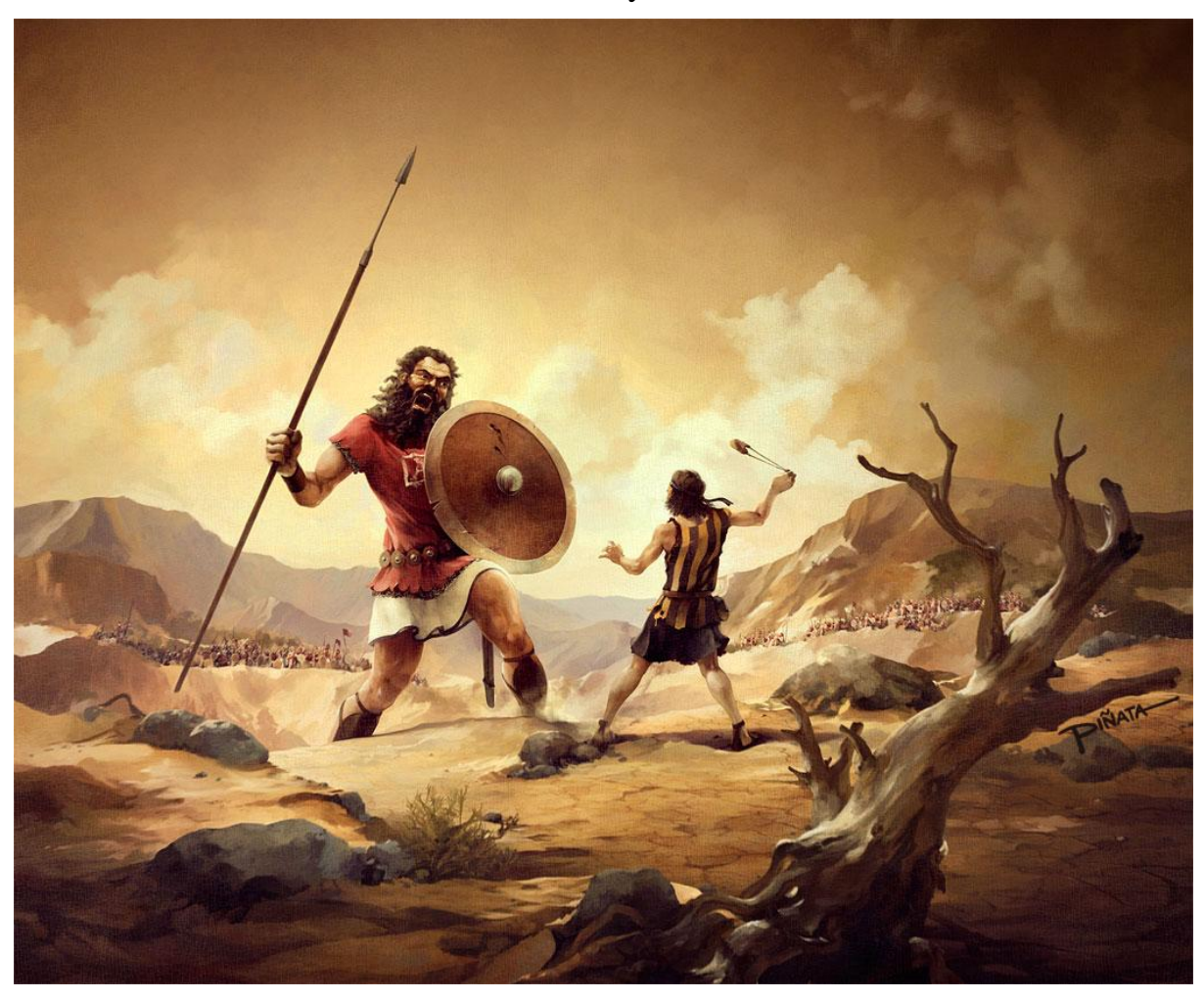
"Thy servant slew both the lion and the bear: and this uncircumcised Philistine shall be as one of them, seeing he hath defied the armies of the living God" 1 Samuel 17:36<sup>1</sup>