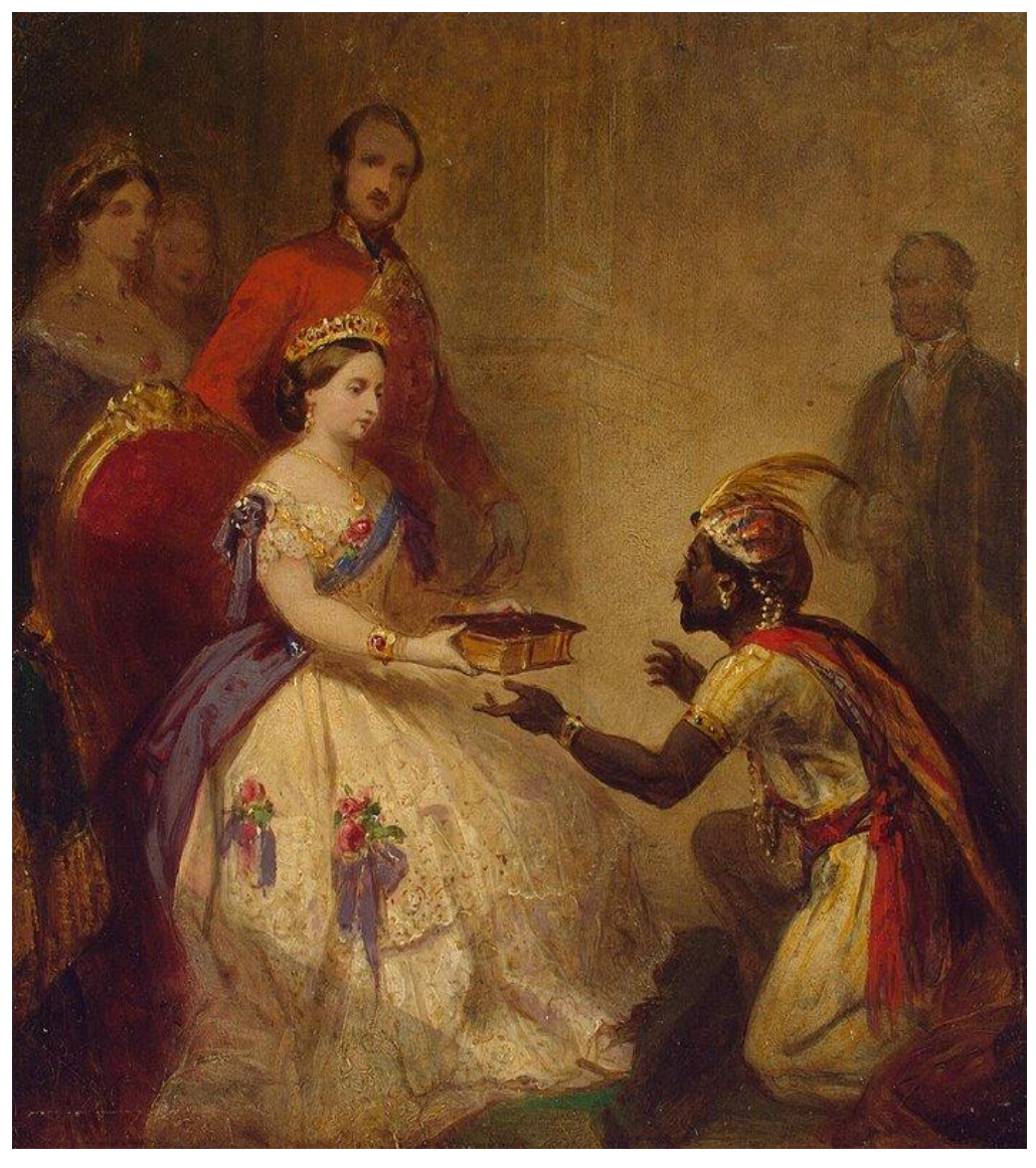
"That Book accounts for the supremacy of England" – Queen Victoria www.arthermitage.org/Thomas-Jones-Barker/Queen-Victoria-Giving-the-Bible-to-an-African-Chief.html

One should note that Britain's deliverance is vividly depicted as follows.