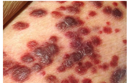
Kaposi’s sarcoma is a cancer that causes patches of abnormal tissue to grow

scienceblog.cancerresearchuk.org/2010/01/22/high-impact-science-kaposi-sarcoma-and-aids-unravelling-a-medical-mystery/ this writer’s emphases.