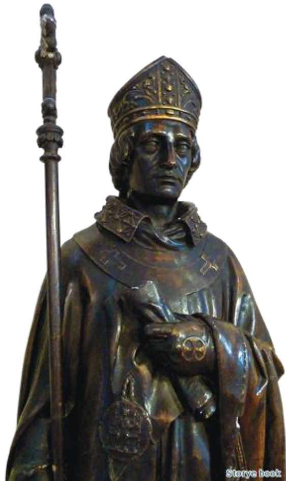
Stephen Langton Archbishop of Canterbury 1207-1228

Chapter-division was apparently the right idea at the right time, and one of the remarkable things about the Langtonian chapter divisions is how they were adopted and propagated by different scholarly communities. Jewish scholars (who had worked with other methods of division previously) soon began observing Langtonian chapter divisions, and the churches of the Christian East took the same divisions over in their biblical studies...