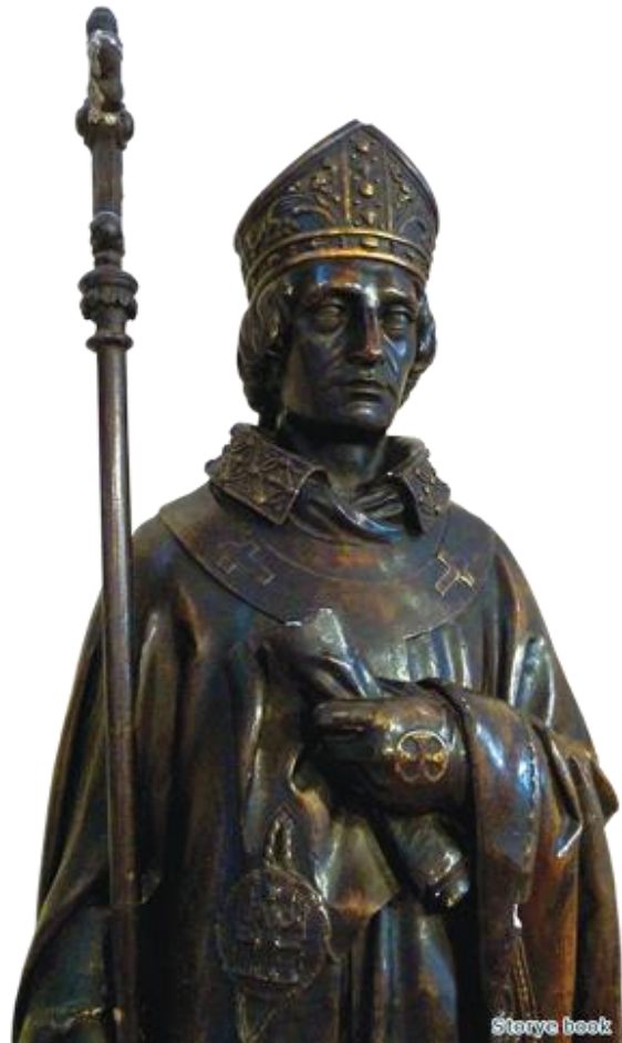
Stephen Langton Archbishop of Canterbury 1207-1228

Chapter-division was apparently the right idea at the right time, and one of the remarkable things about the Langtonian chapter divisions is how they were adopted and propagated by different scholarly communities. Jewish scholars (who had worked with other methods of division previously) soon began observing Langtonian chapter divisions, and the churches of the Christian East took the same divisions over in their biblical studies...