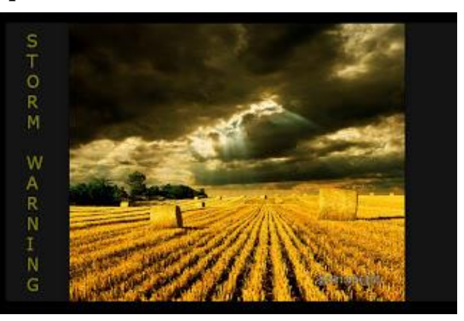
Reaping the Whirlwind the-ten.blogspot.co.uk/2013/07/reapingwhirlwind.html

"For they have sown the wind, and they shall reap the whirlwind..." Hosea 8:7