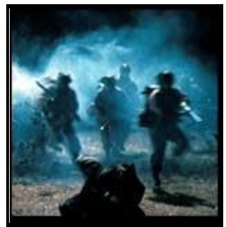
The sheer panic, fear and terror of war

My character later transfers to the Parachute Regiment and sees action in North Africa, Sicily and at Arnhem during the 'Market Garden' operation, where he must reconcile his Christian beliefs with the hideous principle of 'killed or be killed' in desperate, close quarter fighting.