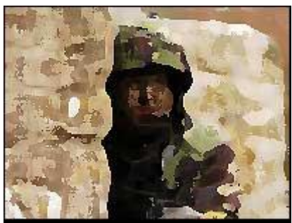
An artist's impression of a soldier in wartime

www.bbc.co.uk/stoke/features/2005/02/sound of battle.shtml