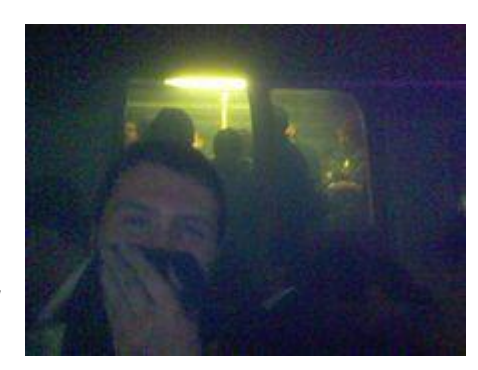
Passengers trapped in a carriage aboard a bombed train en.wikipedia.org/wiki/7_July_2005_London_bombings