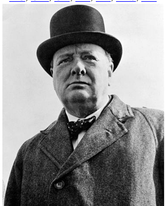
<u>Prime Minister of the United Kingdom</u> en.wikipedia.org/wiki/Winston Churchill

The Right Honourable Sir Winston Churchill KG, OM, CH, TD, DL, FRS, RA