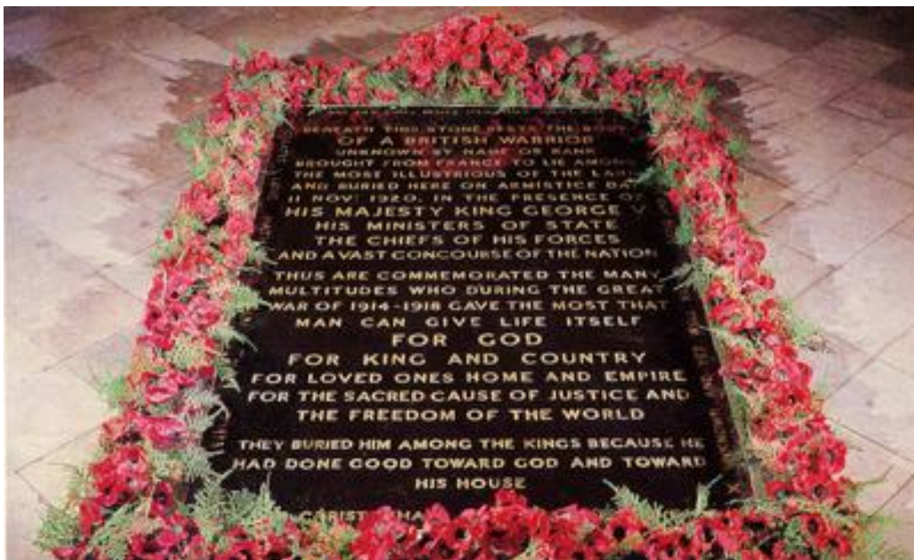
The Tomb of the Unknown Warrior in Westminster Abbey 2

“And they buried him in the city of David among the kings, because he had done good in Israel, both toward God, and toward his house”