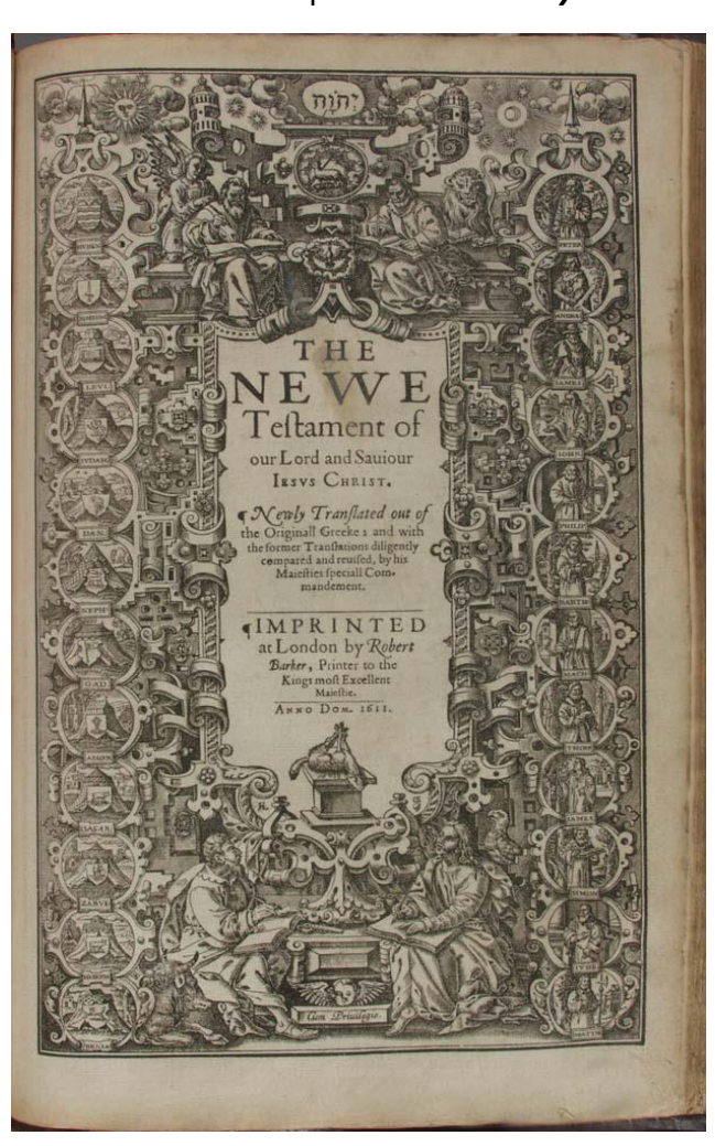
The 1611 King James Bible - Title Page (Newe Testament)

Finally with respect to the authority indeed supremacy of the King James Bible, consider the wisdom of the men who perfected "the royal law...the whole law" James 2:8-10.