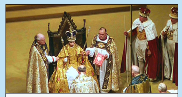
The Queen Enthroned with "The Royal Law"