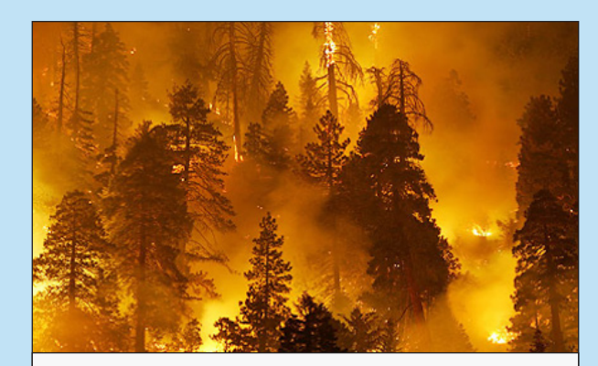
The Fire of Jeremiah Royal Law – James 2v8 <u>www.timefortruth.co.uk/why-av-only/</u>

Britain must therefore regain her only fire-break " the royal law " the AV1611 to receive mercy when God's End Times judgement by fire descends " that the whole nation perish not " John 11:50.