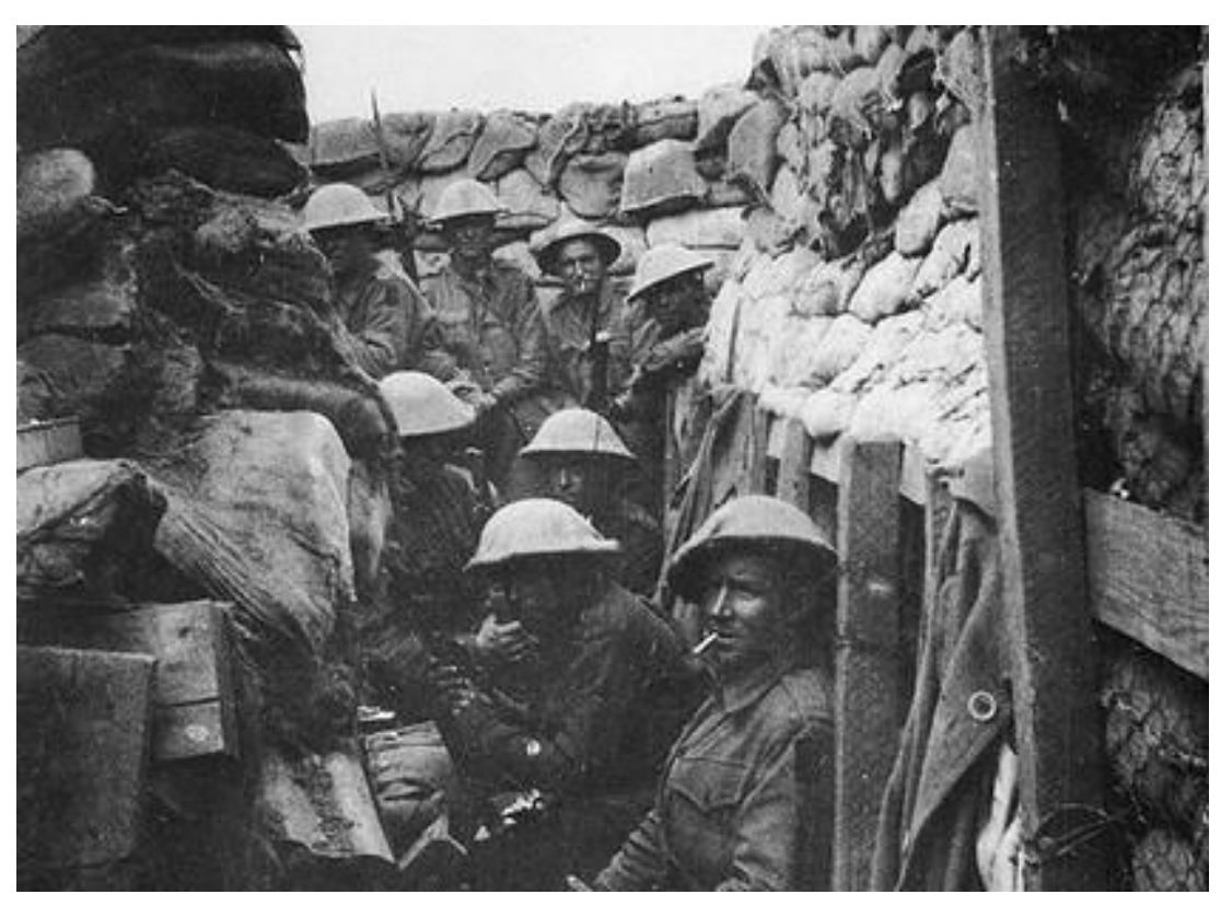
Australians in the trenches at Fromelles July 19<sup>th</sup> 1916<sup>4</sup> Only three of the men pictured survived the battle; all three were wounded<sup>5</sup>