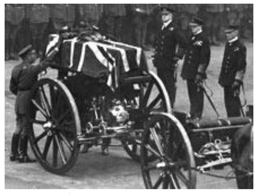
11<sup>th</sup> November 1920: King George V placing a wreath on the coffin of the Unknown Warrior<sup>1</sup>