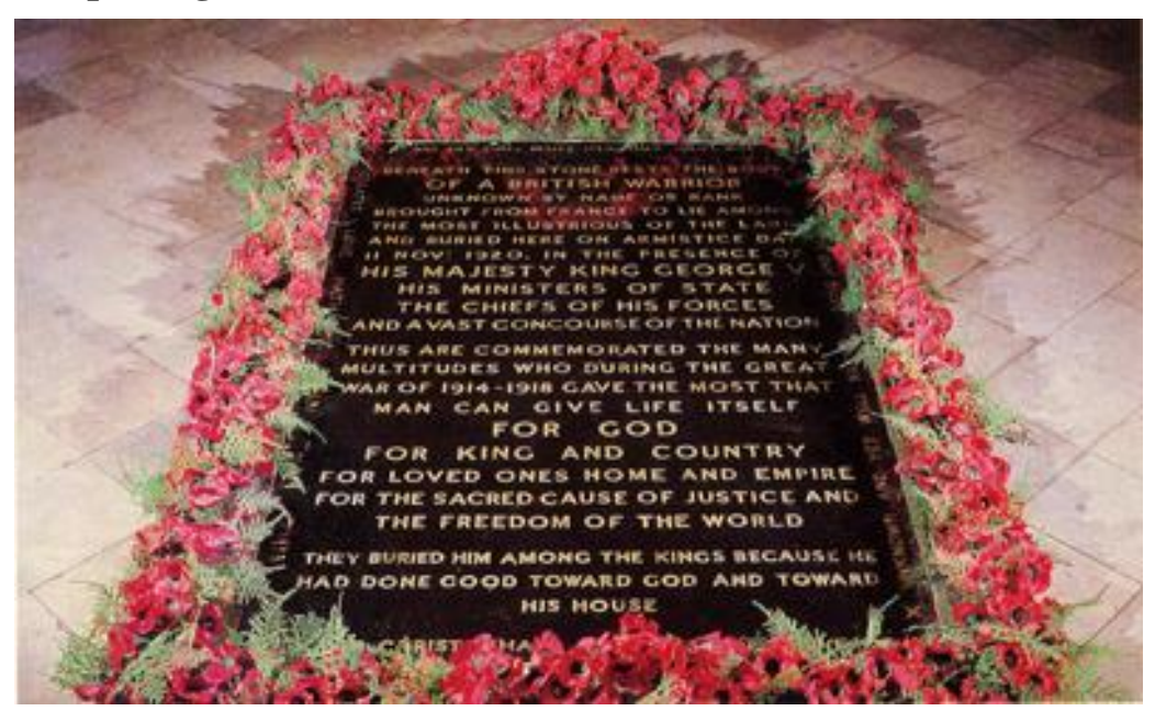
The Tomb of the Unknown Warrior in Westminster Abbey<sup>2</sup>

And they buried him in the city of David among the kings, because he had done good in Israel, both toward God, and toward his house 2 Chronicles 24:16